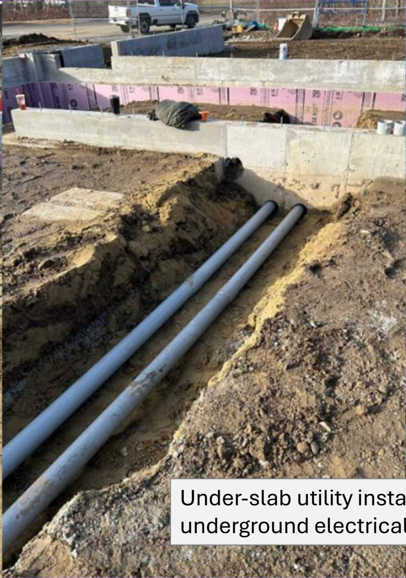
Under-slab utility installation is ongoing, underground electrical conduit shown above.