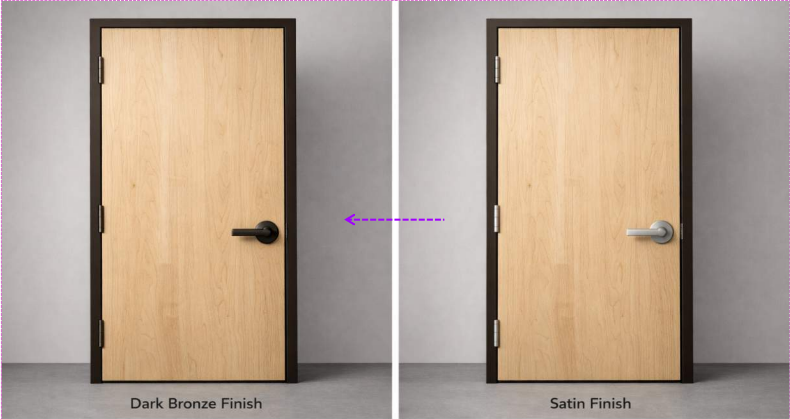
Dark Bronze Finish