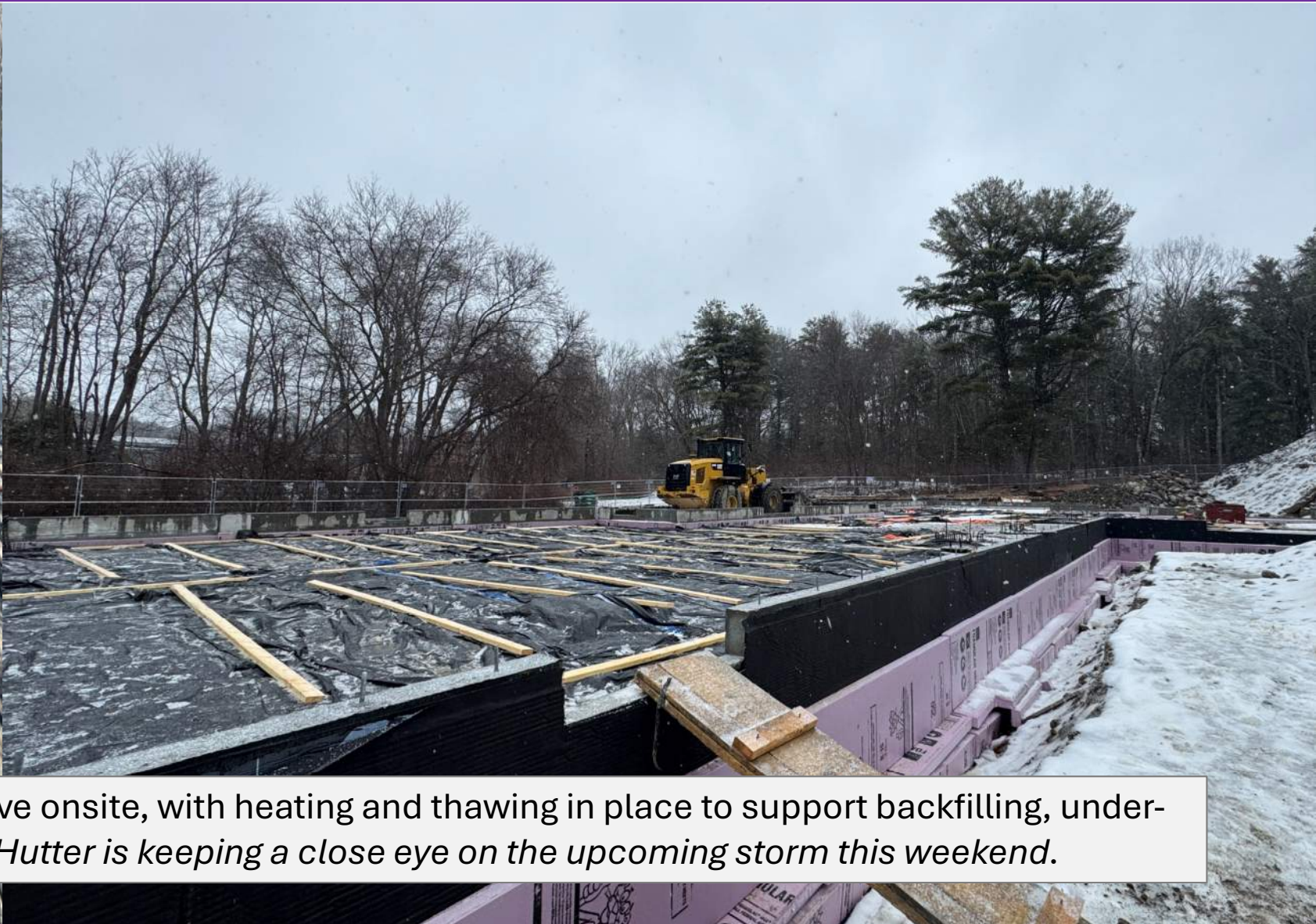
Winter weather prep remains active onsite, with heating and thawing in place to support backfilling, under-slab utilities, and concrete work. Hutter is keeping a close eye on the upcoming storm this weekend.