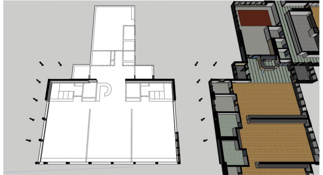
New plan: Rooms turn 90 degrees