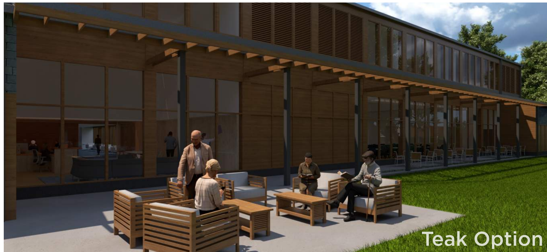
COA Porch View