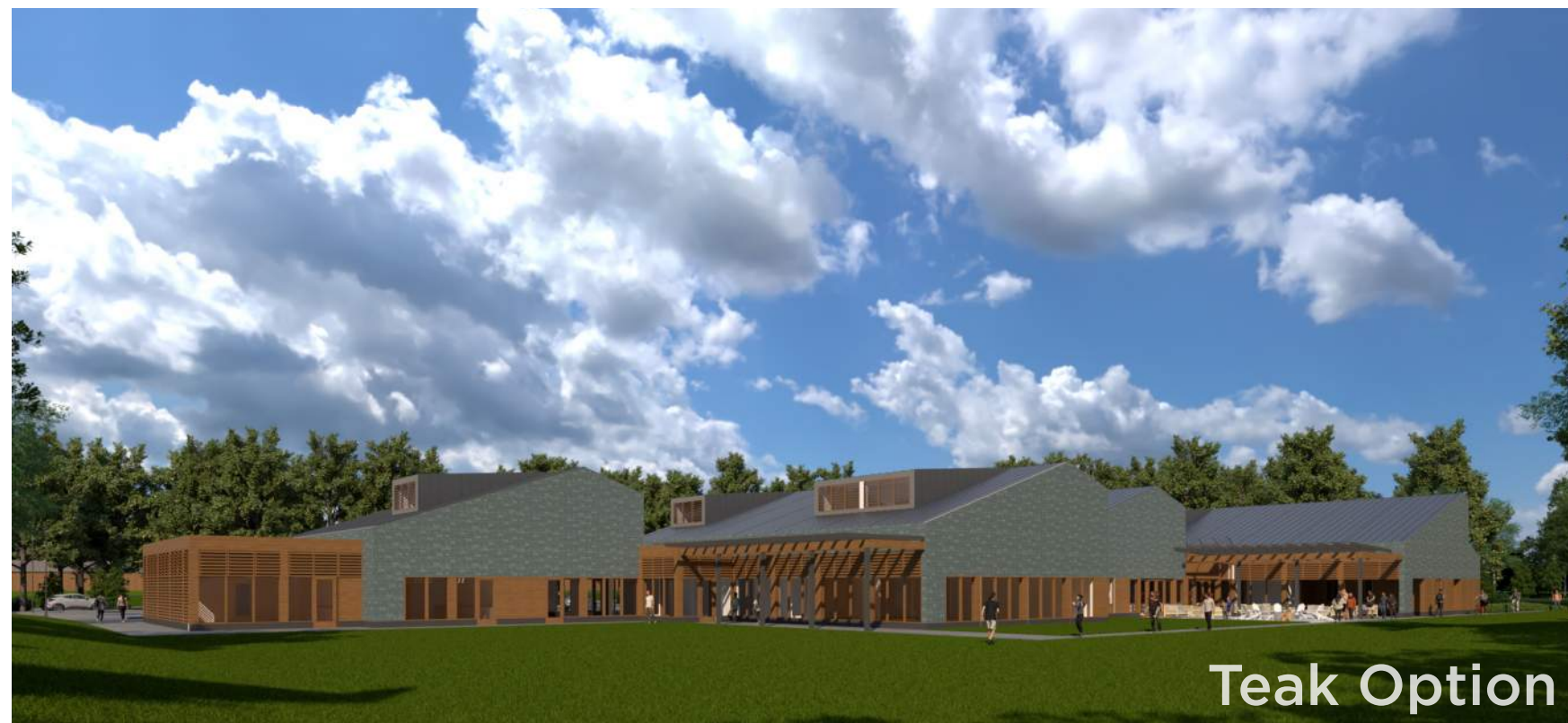
East Play Space View